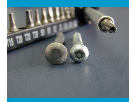
"Unique tamper proof frame is virtually ligature free ..."

"DuraVision™ Cell Observation Mirrors provide safe and reliable viewing...″